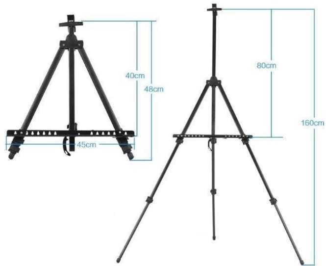
Fig. 1: Poster stand